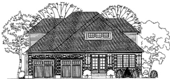
Kirkwood FRONT ELEVATION APPROX. -2666 SQ. FT.