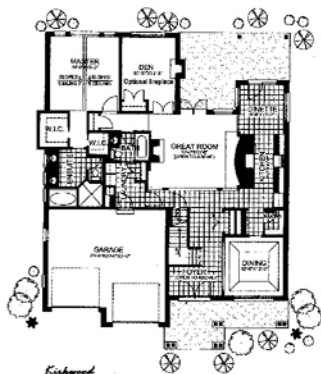
Kirkwood FIRST FLOOR PLAN APPROX. -1986 SQ. FT.