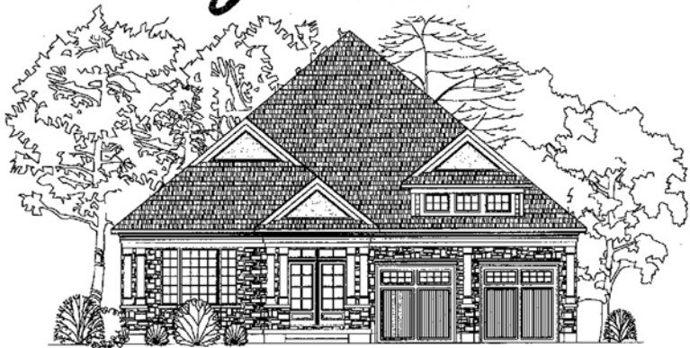
THE RIVERPOINT FRONT ELEVATION APPROX.-2140 SQ. FT.