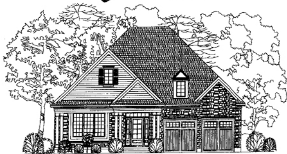
THE SUGARHILL FRONT ELEVATION APPROX.-2029 SQ. FT.